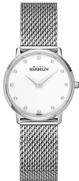
16915/51B Ø 30.5mm