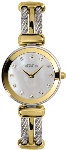
17125/BT59 Ø 26mm

Swiss Movement - Quartz Stainless steel High Grade Gold PVD Sapphire Crystal Water resistant 30 m