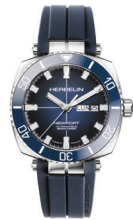
Newport Diver Automatic