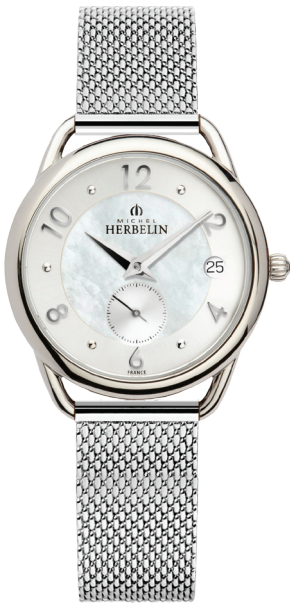
18397/29B Ø 34mm