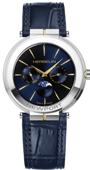
12722/T15BL Ø 41.5 mm Thickness 6.95