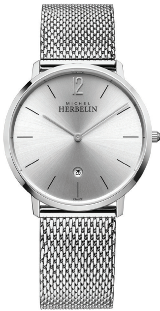
19515/11B Ø 38.7mm