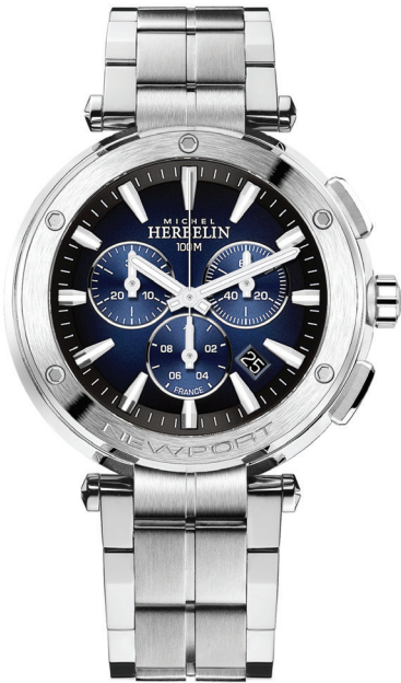
37688/B35 WR 100m Ø 43mm