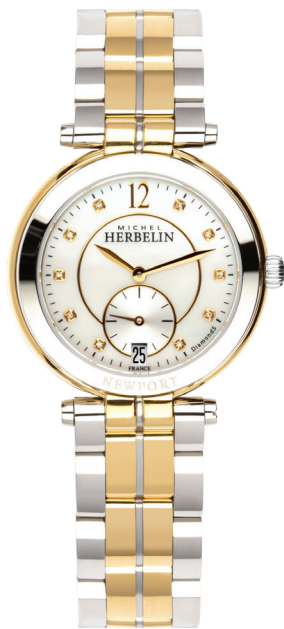
18384/BT89 WR 50m Ø 34mm