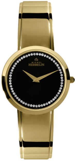
17082/BP64 Ø 31mm