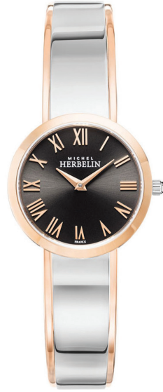
17056/BTR22 Ø 28mm