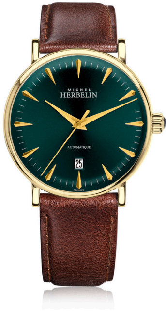
1647/P16BR Ø 40mm

Swiss Movement - Automatic 316L - Stainless steel Sapphire Crystal Water resistant 30 m