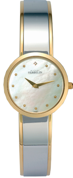
17056/BT19 Ø 28mm