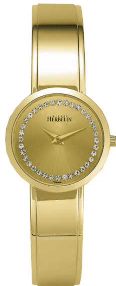
17056/BP63 Ø 28mm