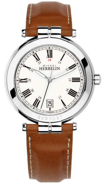
12254/AP01GO WR 50m Ø 39mm