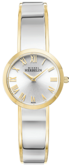
17056/BT21 Ø 28mm