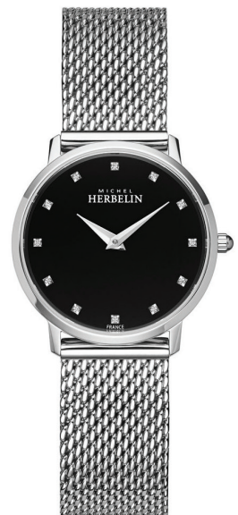
16915/44B Ø 30.5mm