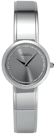
17056/B62 Ø 28mm

Swiss Movement - Quartz 316L - Stainless steel Sapphire Crystal Water resistant 30 m