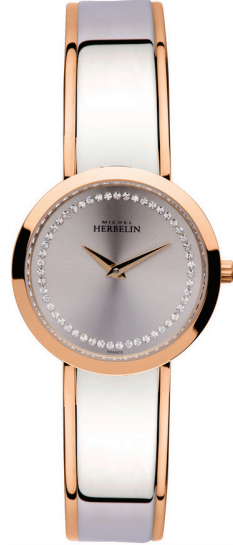
17056/BTR62 Ø 28mm