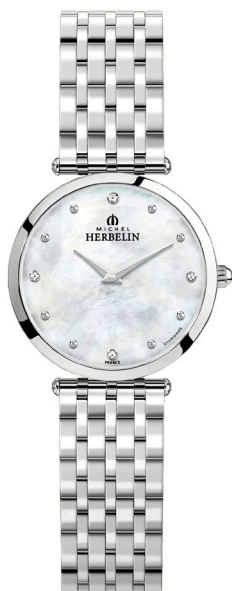
17116/B89 Ø 28mm