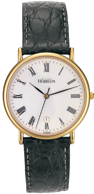
12443/P01 Ø 34mm