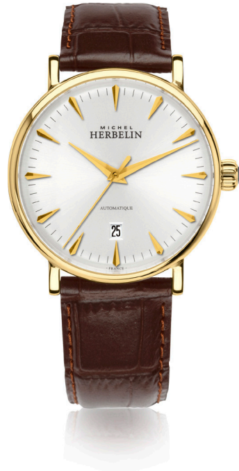
1647/P11MA Ø 40mm