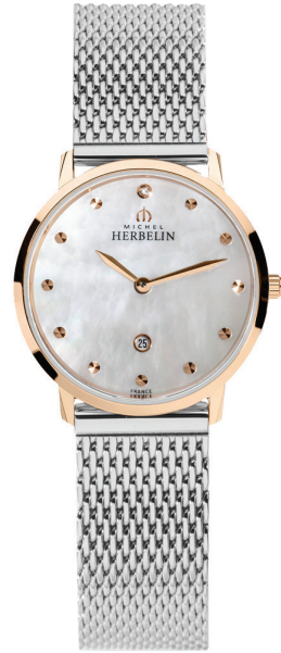
16915/PR59B Ø 30.5mm