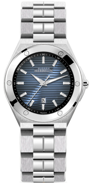
14245/B15 WR 100m Ø 34.5mm