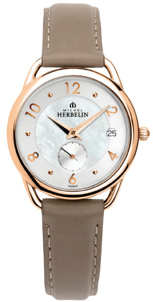
18397/PR29GR Ø 34mm