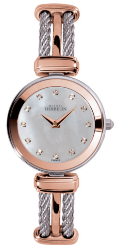
17125/BT4R59 Ø 26mm