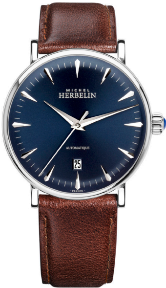
1647/AP15BR Ø 40mm

Swiss Movement - Automatic 316L - Stainless steel Sapphire Crystal Water resistant 30 m