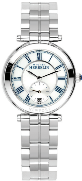
18384/B29 WR 50m Ø 34mm

Swiss Movement - Quartz 316 L- Stainless steel Sapphire Crystal Water resistant 100 m