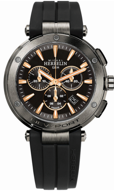
37688/G33TCA WR 100m Ø 40.5mm