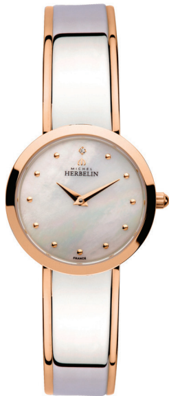
17056/BTR19 Ø 28mm