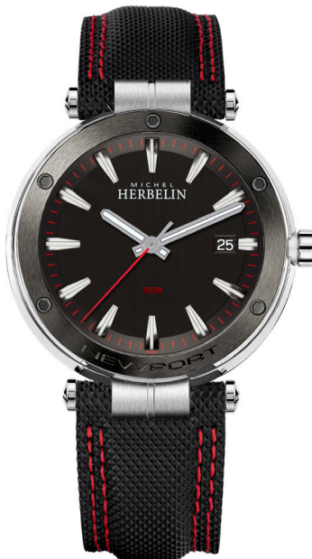
12288/AG44 WR 100m Ø 40.5mm