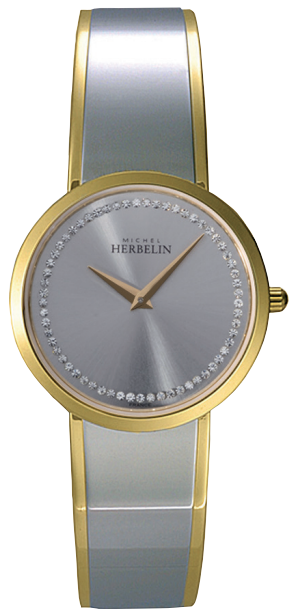
17082/BT62 Ø 31mm