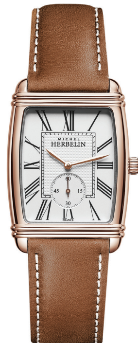
10638/PRO8GO Ø 30 x 35.5 mm