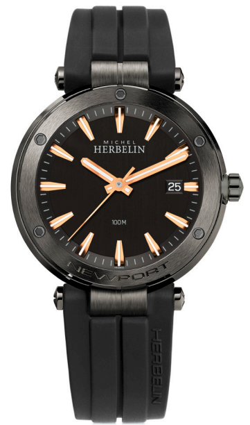
12288/G33TCA WR 100m Ø 40.5mm