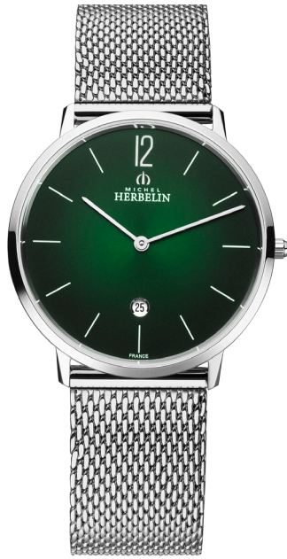
19515/16NB Ø 38.7mm