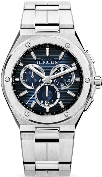
37645/B15 WR 100m Ø 42mm