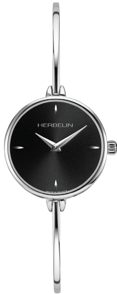
17206/B14 Ø 26 mm