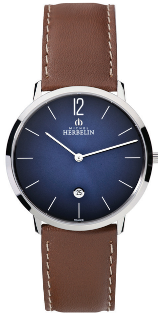
19515/15 Ø 38.7mm