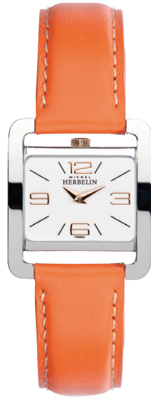
17137/TR11OR Ø 25.5 x 19 mm