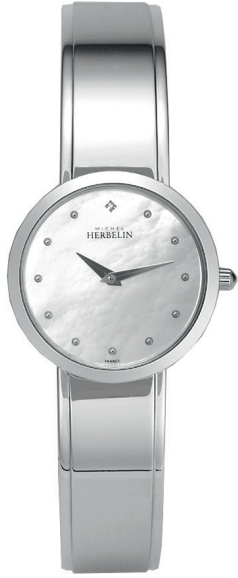
17056/B19 Ø 28mm