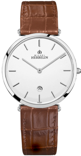
19406/11GO Ø 38mm