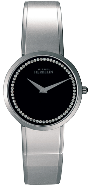
17082/B64 Ø 31mm