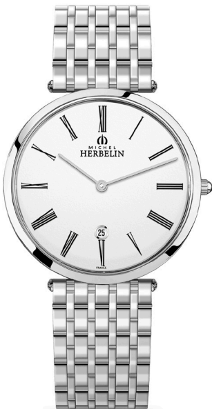
19416/B01N Ø 38mm