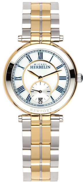
18384/BT29 WR 50m Ø 34mm