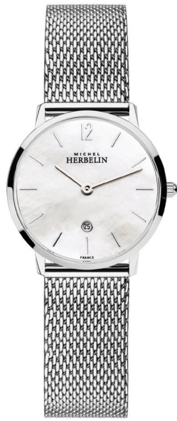
16915/19B Ø 30.5mm