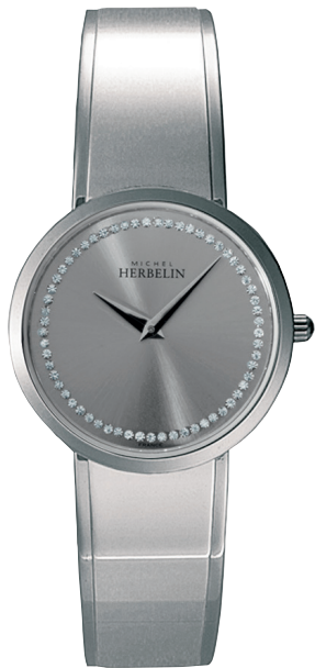
17082/B62 Ø 31mm