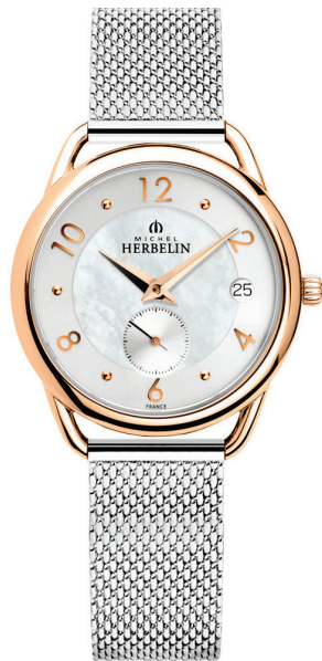
18397/PR29B Ø 34mm