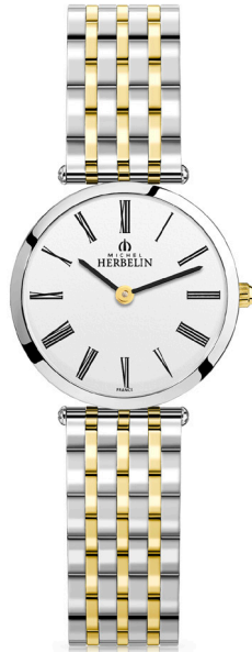
17116/BT01N Ø 28mm