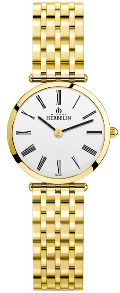
17116/BP01N Ø 28mm