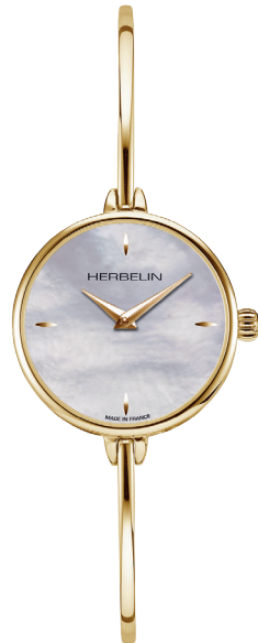
17206/BP19 Ø 26 mm