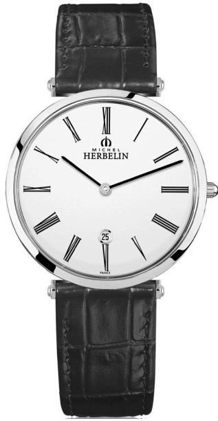
19406/01N Ø 38mm