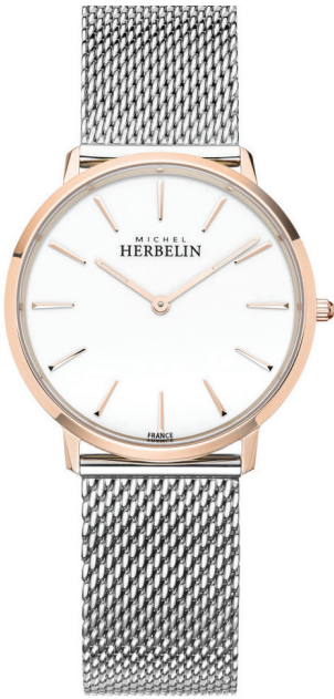
19515/PR11B Ø 38.7mm