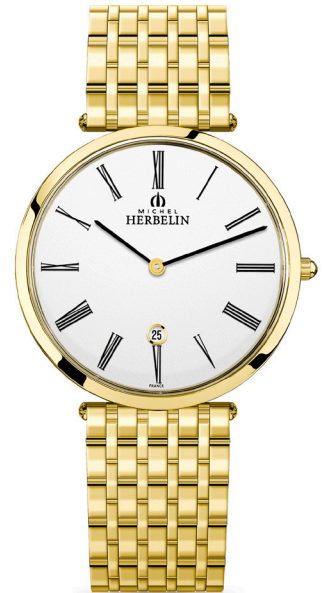
19416/BP01N Ø 38mm