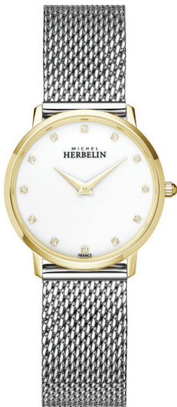
16915/P51B Ø 30.5mm