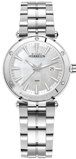
14288/B19 WR 100m Ø 34mm