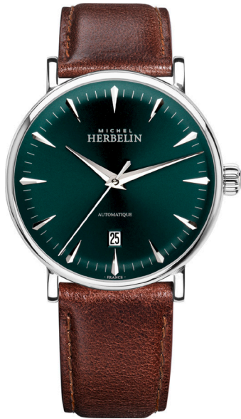
1647/AP16BR Ø 40mm