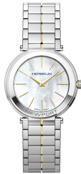
16922/BT19 Ø 32 mm Thickness 5.85 mm