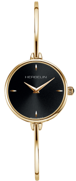
17206/BP14 Ø 26 mm