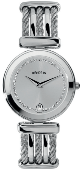
19415/B62 Ø 31.5mm

Swiss Movement - Quartz Stainless steel High Grade Gold PVD Sapphire Crystal Water resistant 30 m