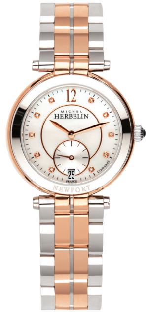
18384/BTR89 WR 50m Ø 34mm