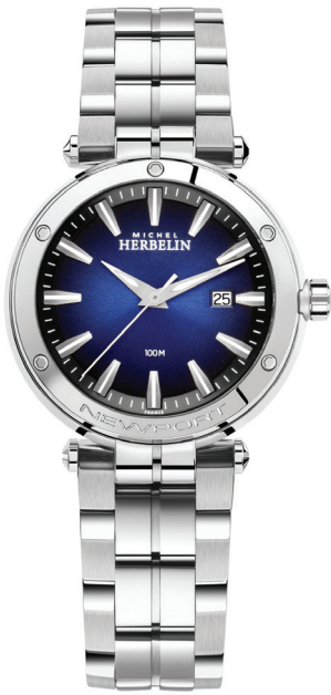
14288/B15 WR 100m Ø 34mm

Swiss Movement - Quartz 316 L- Stainless steel Sapphire Crystal Water resistant 100 m