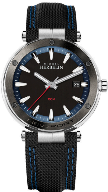
12288/AG45 WR 100m Ø 40.5mm