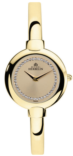
17413/BP63 Ø 26mm