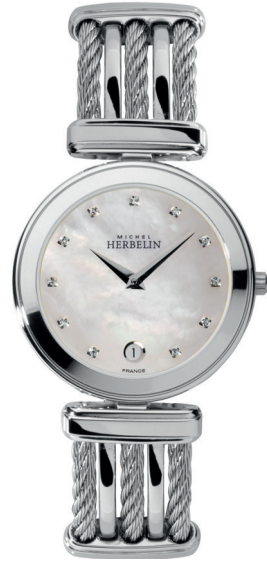
19415/B59 Ø 31.5mm