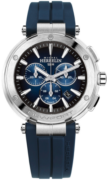
37688/35CB WR 100m Ø 43mm

Swiss Movement - Quartz 316 L- Stainless steel Sapphire Crystal Water resistant 100 m