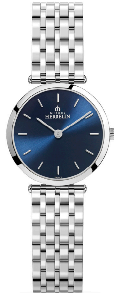
17116/B15 Ø 28mm