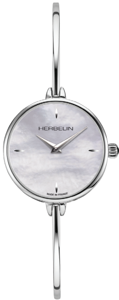
17206/B19 Ø 26 mm