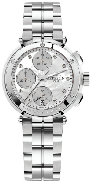
35688/B89 WR 100m Ø 35mm Diamond

Swiss Chronograph Movement - Quartz 316 L- Stainless steel Sapphire Crystal Water resistant 100 m