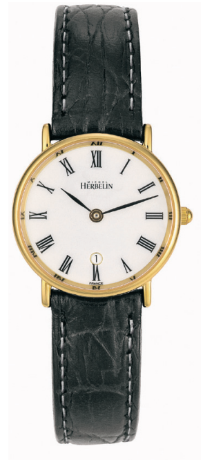
16845/P01 Ø 26mm