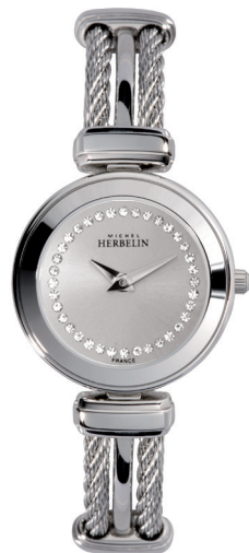
17125/B62 Ø 26mm