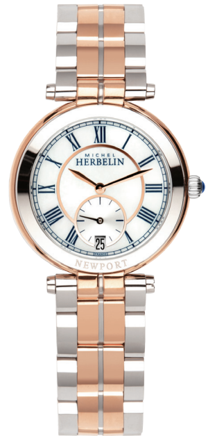
18384/BTR29 WR 50m Ø 34mm