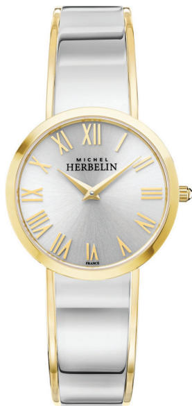
17082/BT21 Ø 31mm