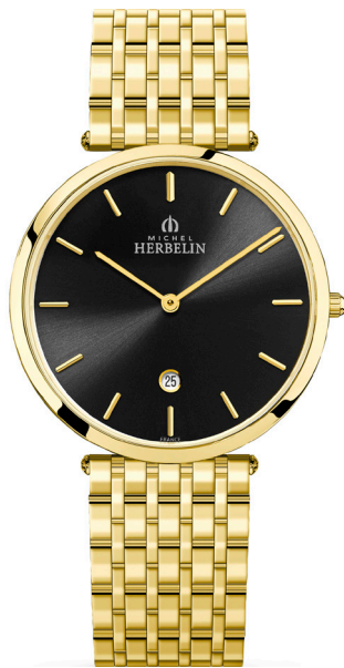
19416/BP14N Ø 38mm