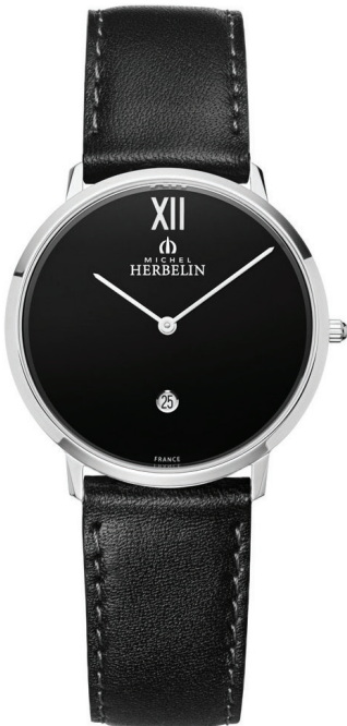
19515/04 Ø 38.7mm