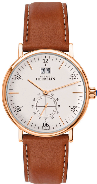
18247/PR11GO Ø 40mm