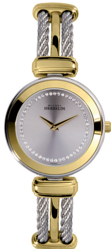
17125/BT62 Ø 26mm