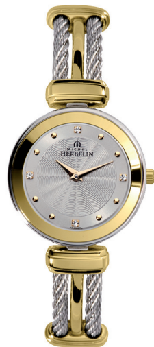
17125/BT12 Ø 26mm