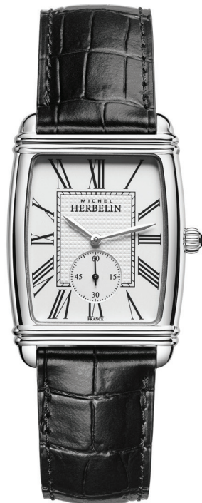
10638/08 Ø 30 x 35.5 mm