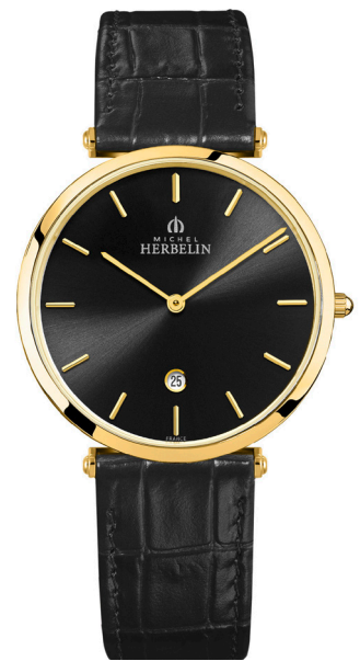
19406/P14N Ø 38mm