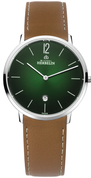
19515/16NGO Ø 38.7mm