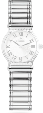
BRAC.17443/AP Roll bracelet