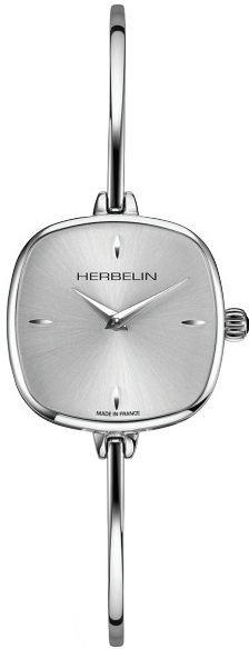
17207/B11 Ø 24 x 24 mm