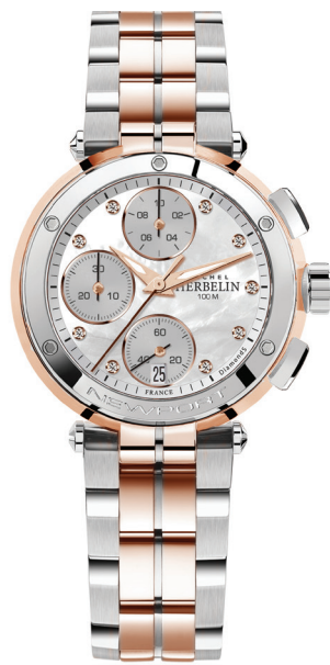
35688/BTR89 WR 100m Ø 35mm Diamond