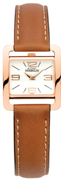
17137/PR11GO Ø 25.5 x 19 mm