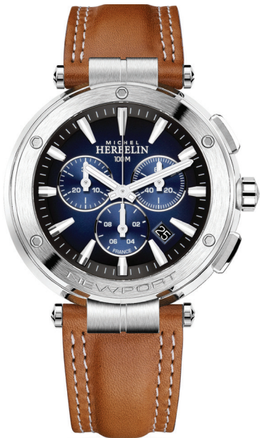
37688/35GON WR 100m Ø 43mm