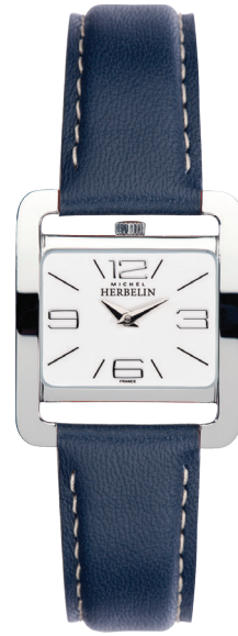
17137/11BL Ø 25.5 x 19 mm