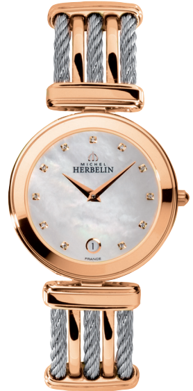
19415/BT5R59 Ø 31.5mm