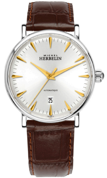
1647/T11MA Ø 40mm