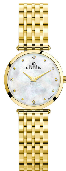
17116/BP89 Ø 28mm