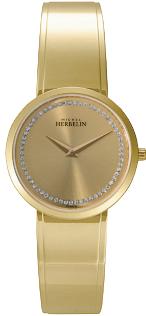
17082/BP63 Ø 31mm