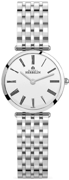
17116/B01N Ø 28mm

Swiss Movement - Quartz 316L - Stainless steel Sapphire Crystal Water resistant 30 m