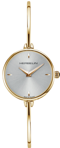
17206/BP11 Ø 26 mm

Stainless steel - Acier Inox 316 L Sapphire Crystal - Water resistant 30 m Quartz Movement 5 ½ Ronda 751 Thickness - Épaisseur : 6.30 mm Ø : 26 mm