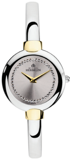
17413/BT62 Ø 26mm

Swiss Movement - Quartz Stainless steel High Grade Gold PVD Sapphire Crystal Water resistant 30 m.