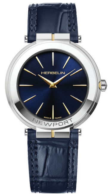
19522/T15BL Ø 40 mm Thickness 5.85