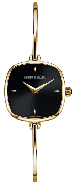
17207/BP14 Ø 24 x 24 mm