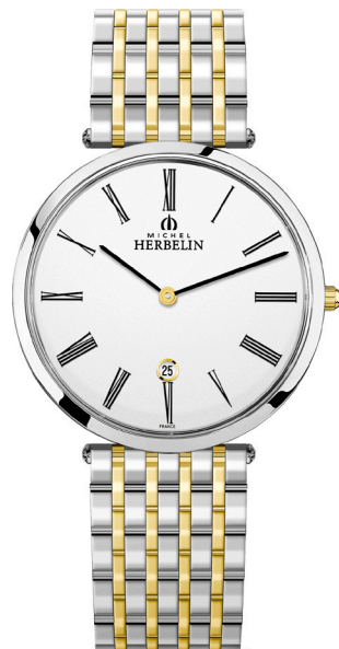
19416/BT01N Ø 38mm