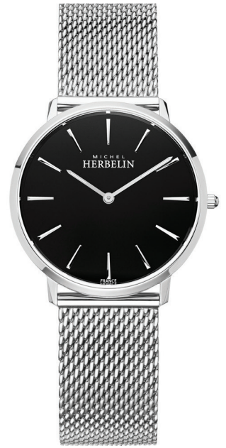
19515/24NB Ø 38.7mm