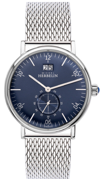
18247/15B Ø 40mm