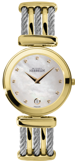
19415/BT59 Ø 31.5mm