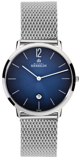
19515/15B Ø 38.7mm