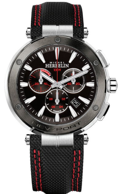
37688/AG44 WR 100m Ø 43mm