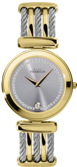
19415/BT62 Ø 31.5mm