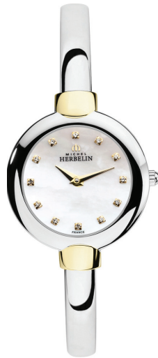
17413/BT59 Ø 26mm