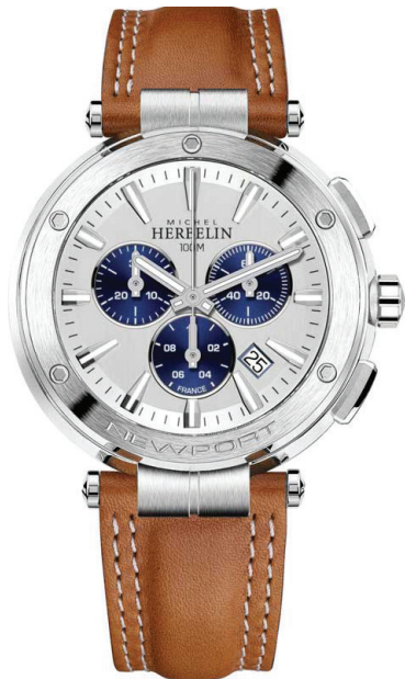
37688/42GON WR 100m Ø 43mm