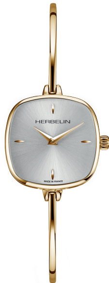
17207/BP11 Ø 24 x 24 mm