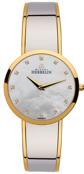
17082/BT59 Ø 31mm