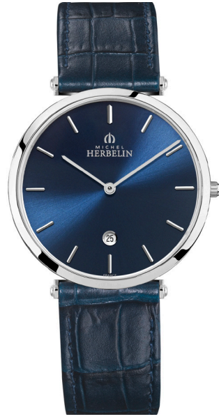
19406/15BL Ø 38mm