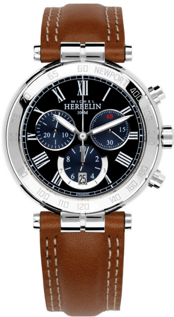
37654/AP04GO WR 100m Ø 40mm

Swiss Movement - Quartz and Quartz Chrono 316 L- Stainless steel Sapphire Crystal Water resistant 100 m