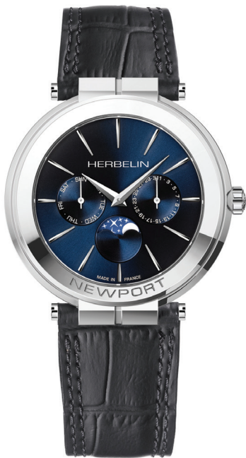
12722/AP15 Ø 41.5 mm Thickness 6.95