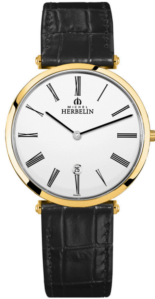
19406/P01N Ø 38mm