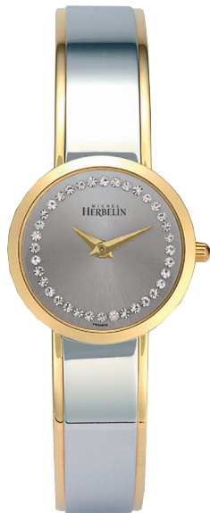
17056/BT62 Ø 28mm