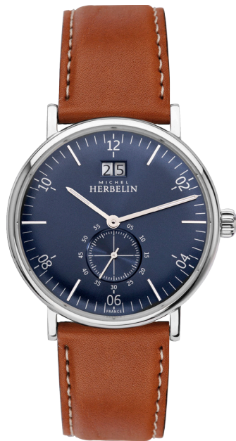
18247/15GO Ø 40mm