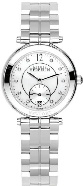
18384/B89 WR 50m Ø 34mm

Swiss Movement - Quartz 316 L- Stainless steel Sapphire Crystal Water resistant 100 m