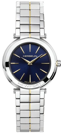
16922/BT15 Ø 32 mm Thickness 5.85 mm

Swiss Movement - Quartz 316 L- Stainless steel Sapphire Crystal Water resistant 30 m