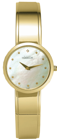
17056/BP19 Ø 28mm