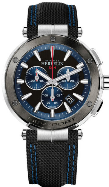
37688/AG65 WR 100m Ø 43mm