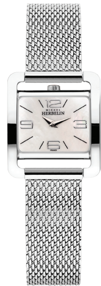
17137/19B Ø 25.5 x 19 mm