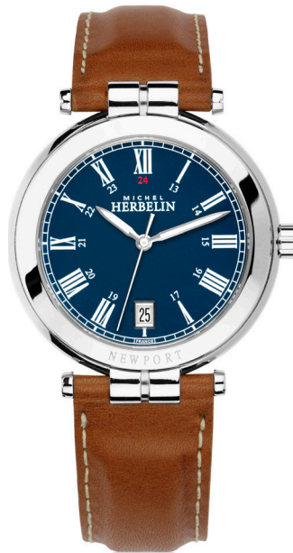
12254/AP05GO WR 50m Ø 39mm