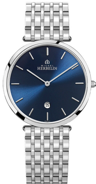
19416/B15 Ø 38mm