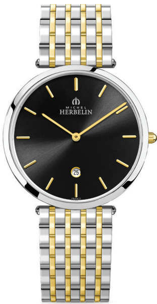
19416/BT14N Ø 38mm