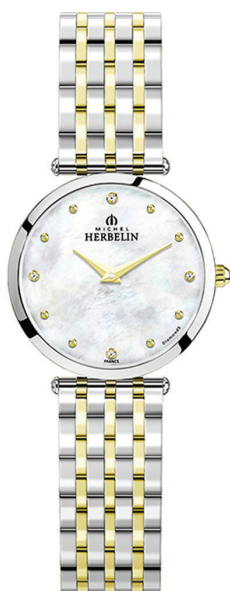
17116/BT89 Ø 28mm