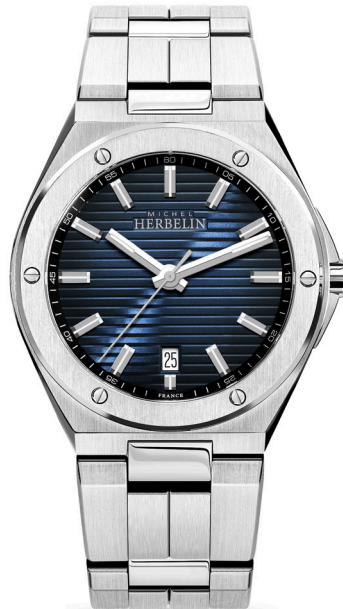
12245/B15 WR 100m Ø 40.5mm