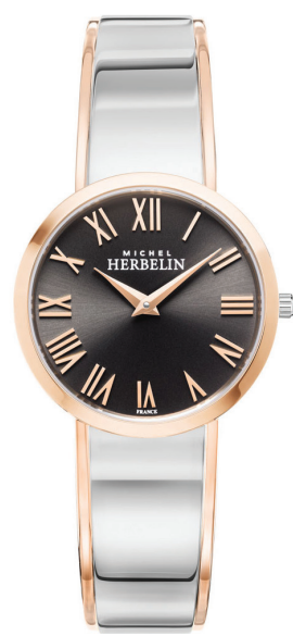
17082/BTR22 Ø 31mm