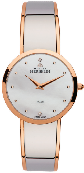
17082/BTR19 Ø 31mm

Swiss Movement - Quartz 316L - Stainless steel Sapphire Crystal Water resistant 30 m