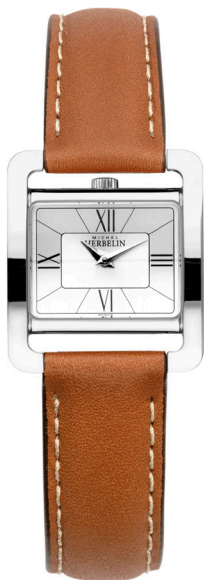
17137/08GO Ø 25.5 x 19 mm