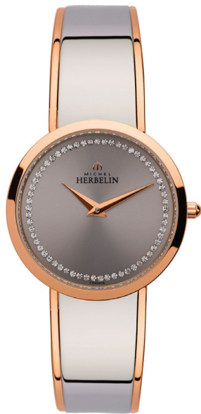
17082/BTR62 Ø 31mm